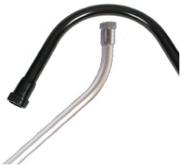
Wands (Various Shapes & Lengths)