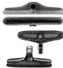
Smooth Surface Tools