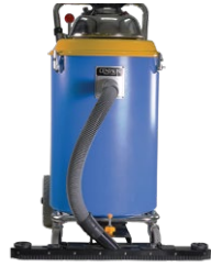
26" Front Mount Squeegee